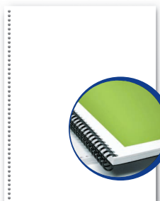
43/44/GBC punch papers are used in spiral/coil booklets

Sales on these items have grown 30% year over year!